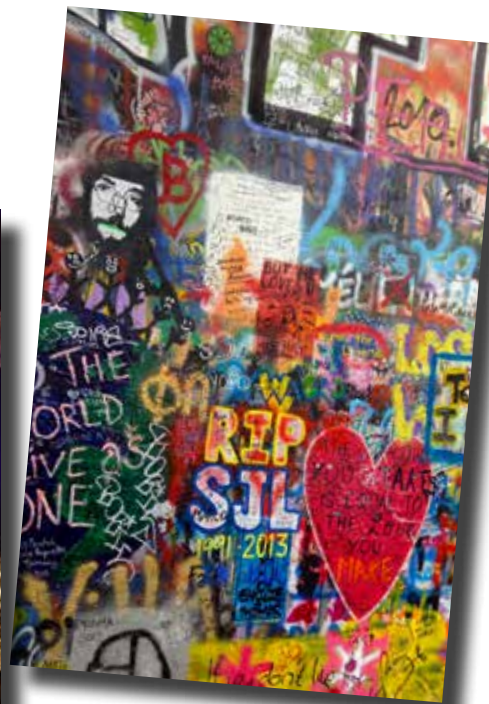
PHOTOGRAPH: Katie Benedict