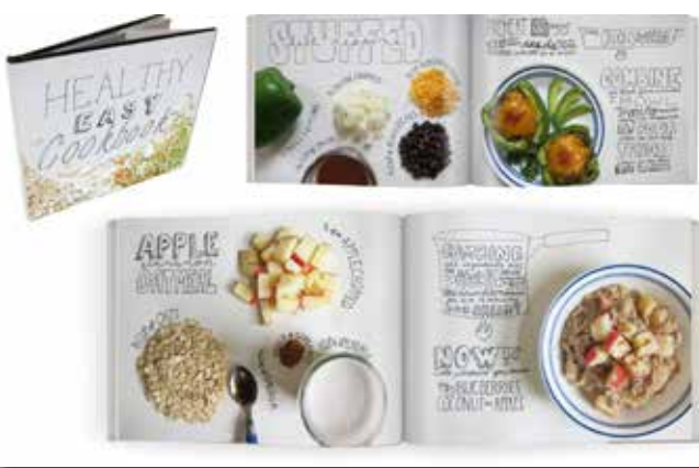
ART WORKS: Silver in Print and Typographic Design, Kathryn Ferons '14

At the Annual AIGA OCDA in Spring 2013, students and alumni from Chapman competed in various categories.