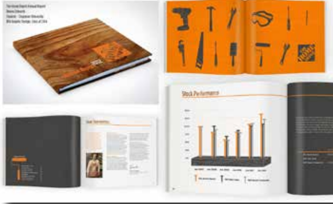
ART WORKS: Gold in Inhouse Design, Deena Edwards '13