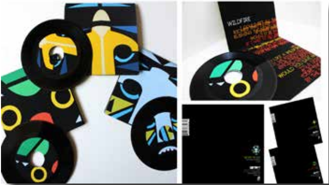
ART WORKS: Silver in Inhouse Design, Rachel Becker '13